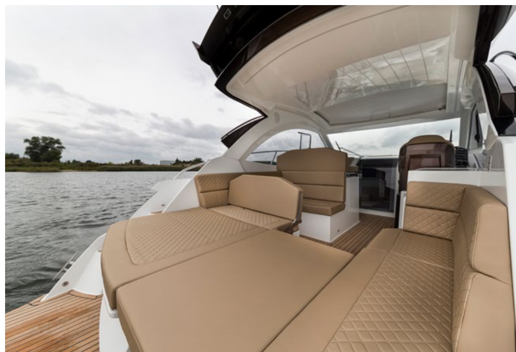
— Use the extra mattress to create a large sundeck facing the aft