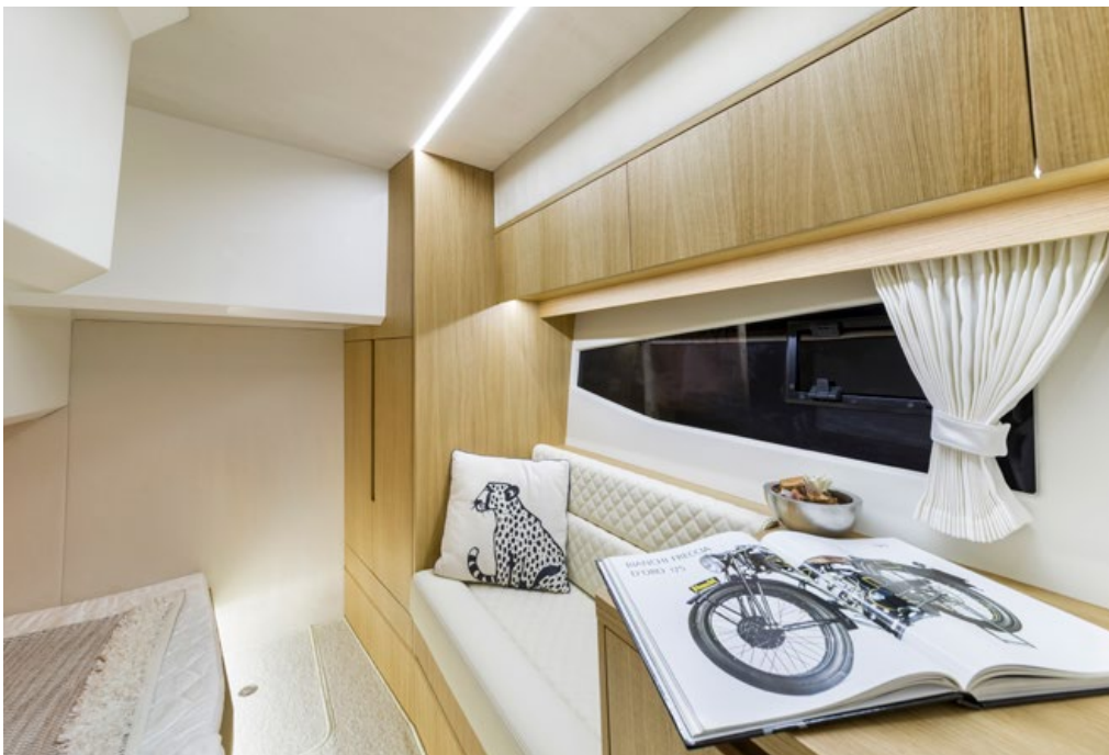
The guest cabin has a large double bed and holds extra storage —