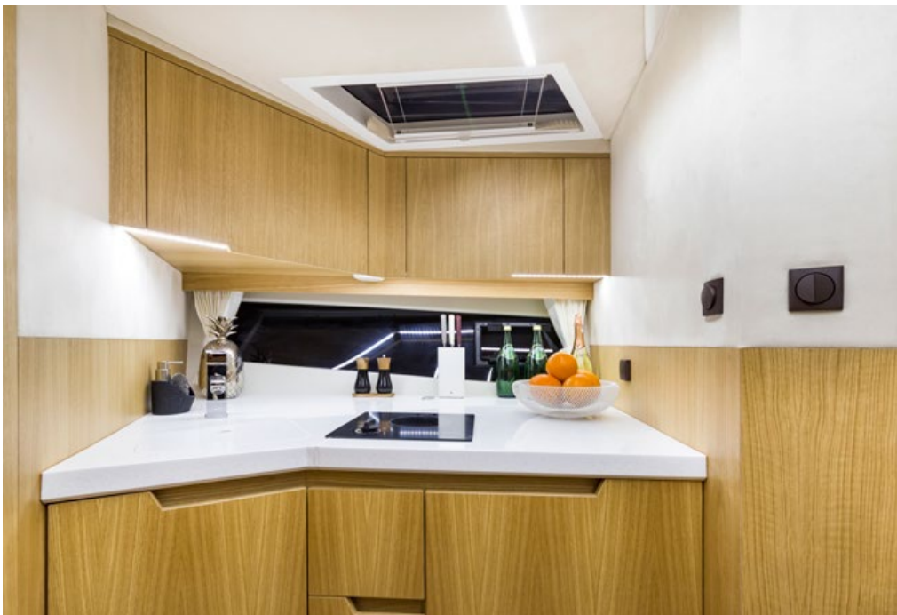
The galley area will hold plenty of supplies —