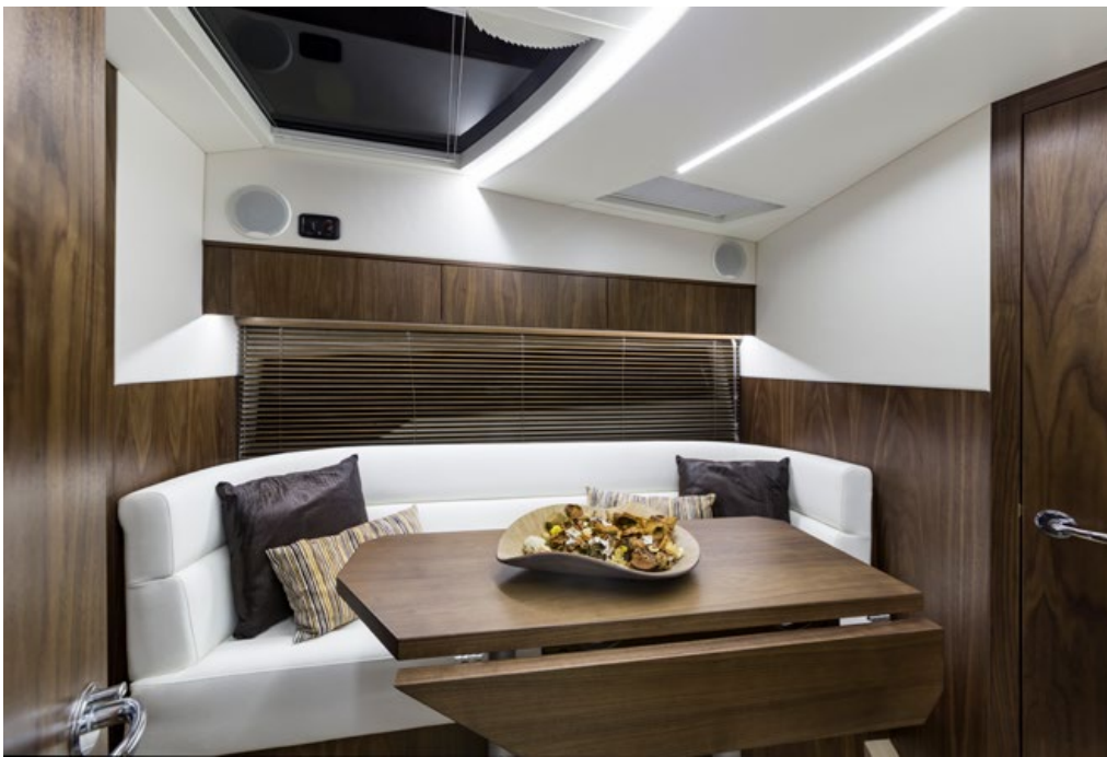
The dining and rest area down below