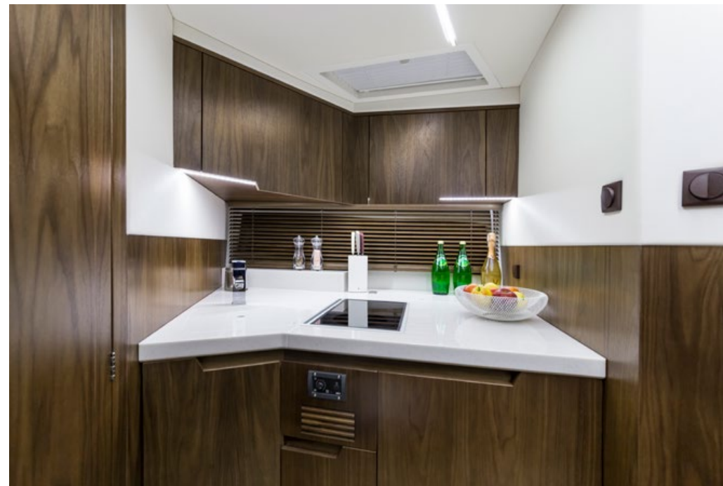
A well equipped galley area