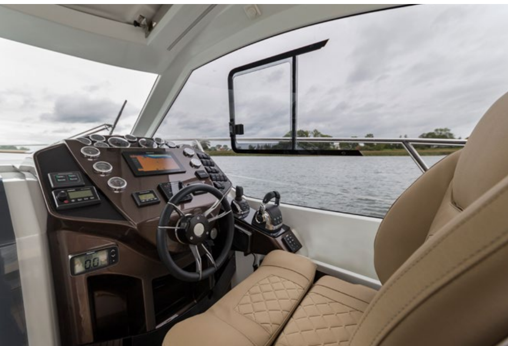
— Precise handling and great visibility from the helm