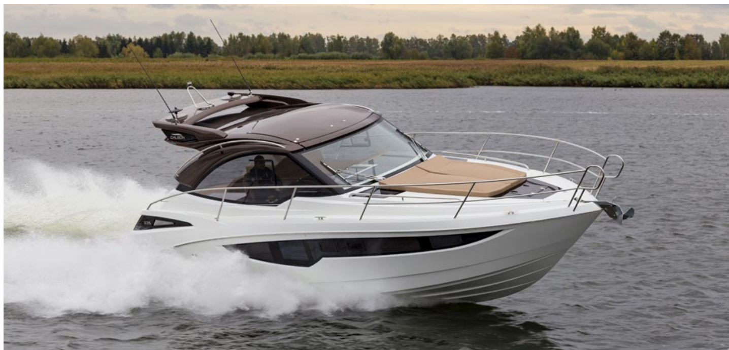
Striking design and smooth cruising of the 335 HTS

The sport cruiser line is highlighted by excellent handling capabilities