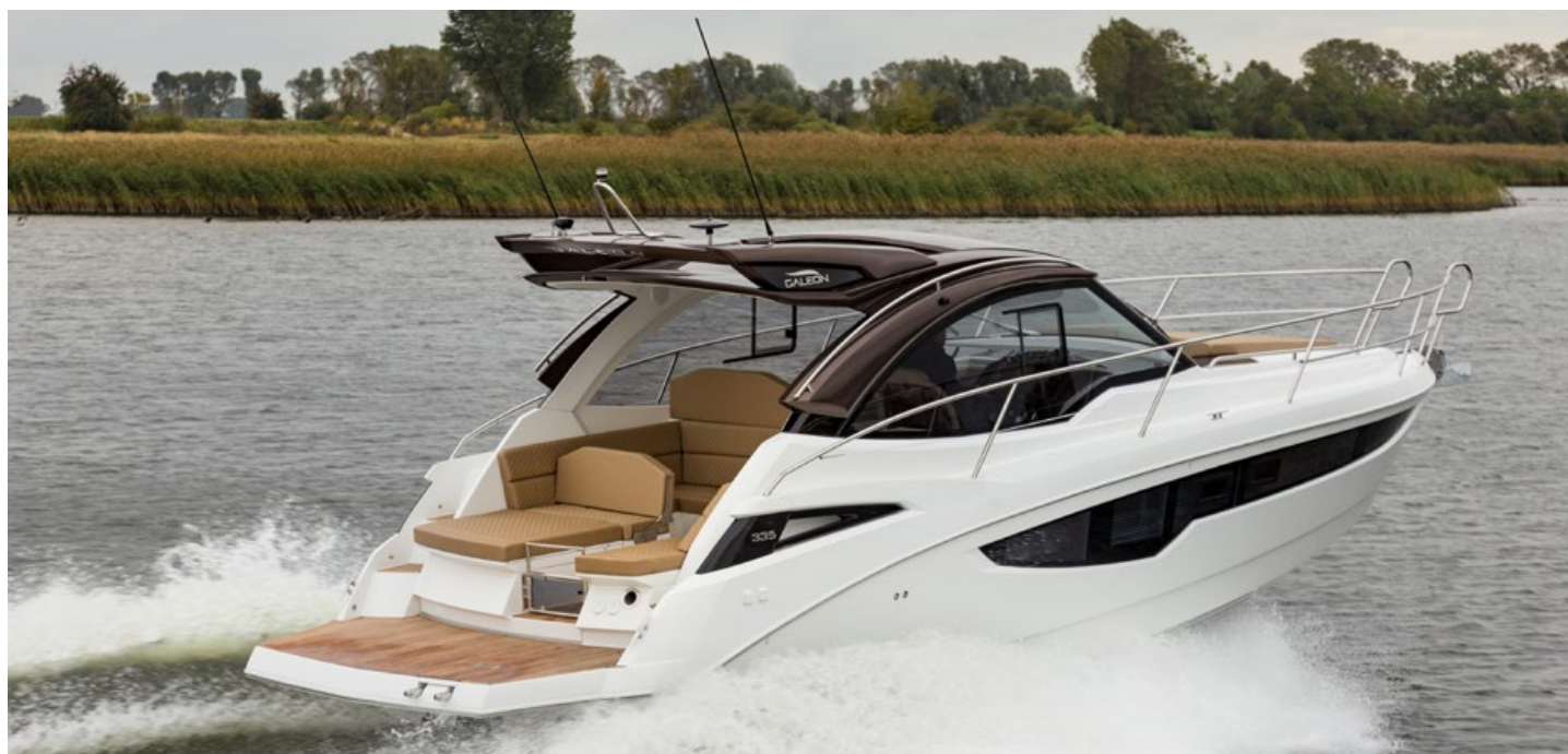
Notice the large bath platform for water based activities