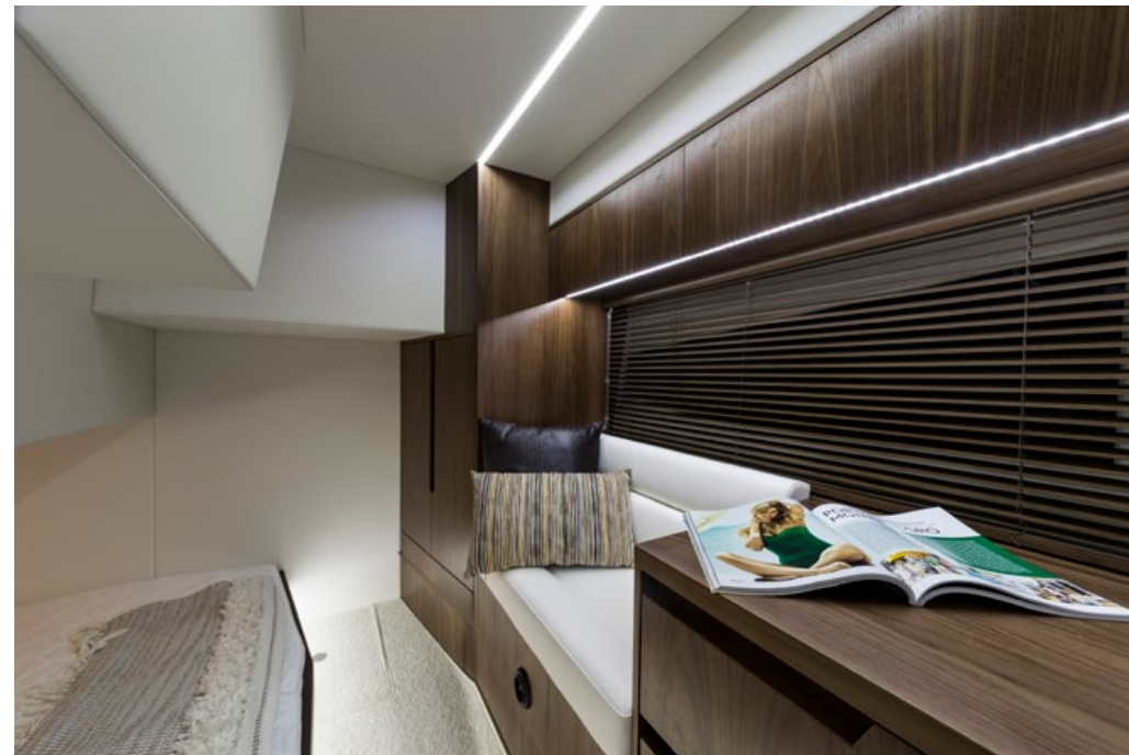
The second cabin with a double bed offers plenty of space