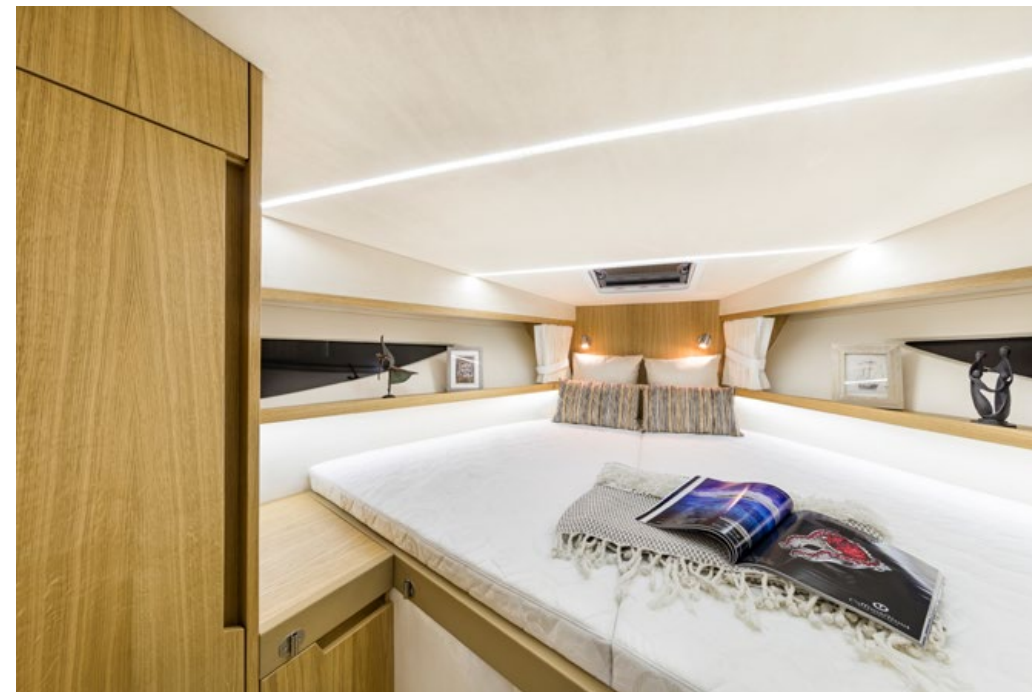
The forward cabin sleeps two —