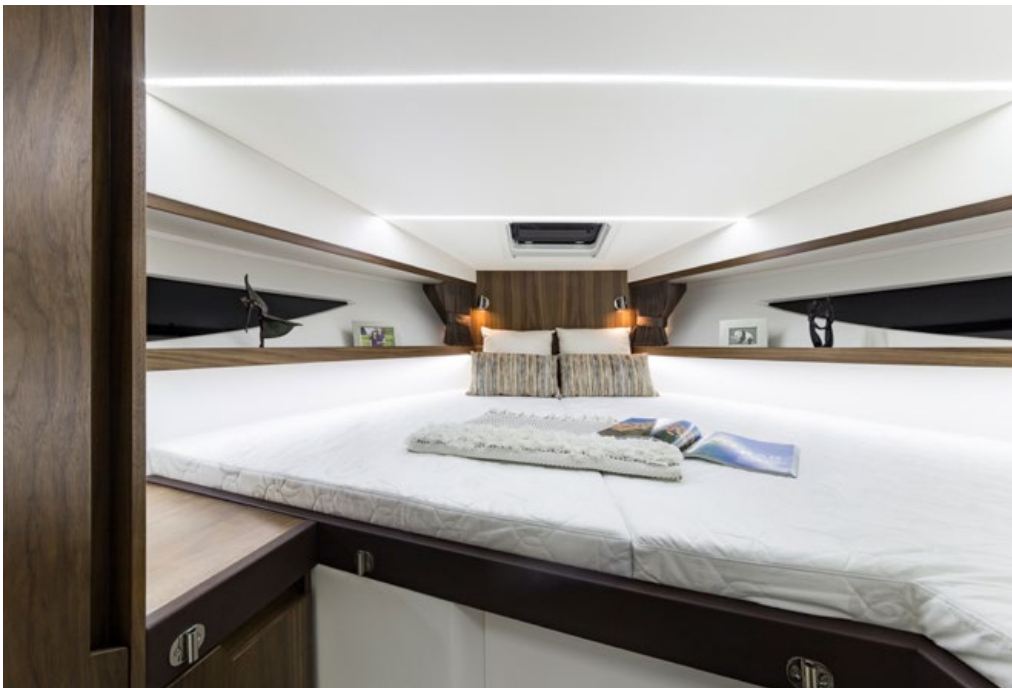
The forward cabin will sleep two with extra space for storage