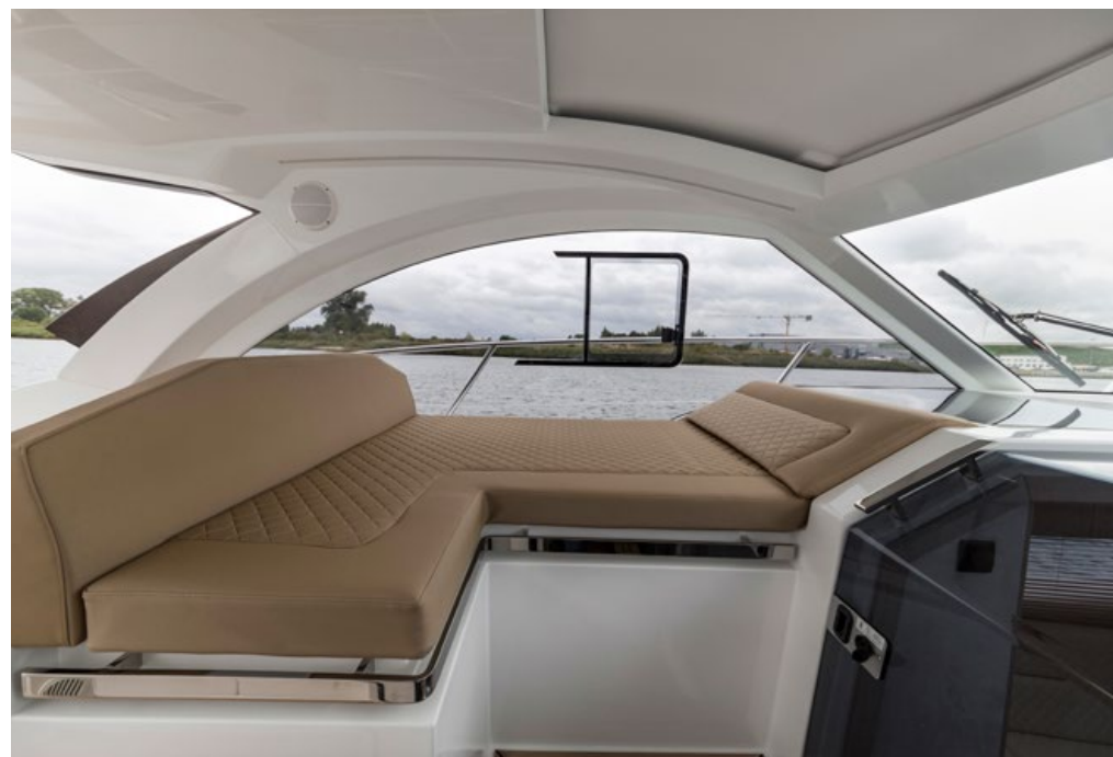
— Social leisure area next to the helm