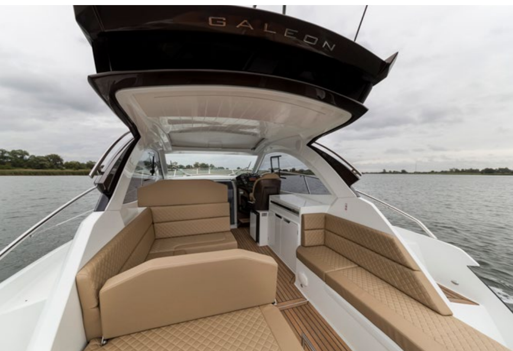
— Plenty of space for fun and relaxation on board of the 335 HTS