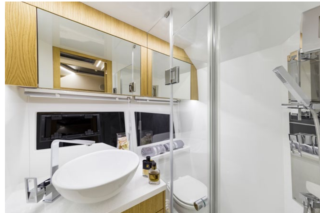
A closed-off shower will help to keep the bathroom dry and tidy —